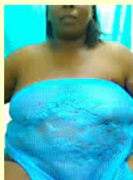
looker289 20/F New York, New York